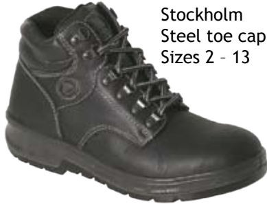
Stockholm Steel toe cap Sizes 2 - 13