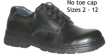
Zaidee No toe cap Sizes 2 - 12