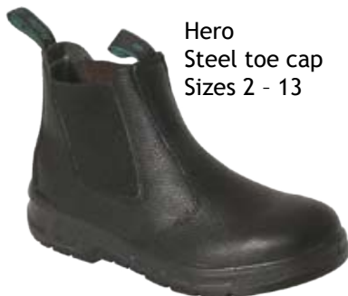
Hero Steel toe cap Sizes 2 - 13