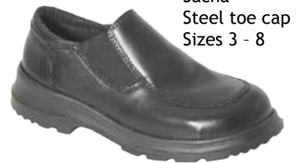
Sacha Steel toe cap Sizes 3 - 8