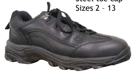
Sonic Steel toe cap Sizes 2 - 13