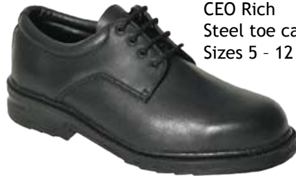
CEO Rich Steel toe cap Sizes 5 - 12