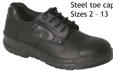
Norfolk Steel toe cap Sizes 2 - 13